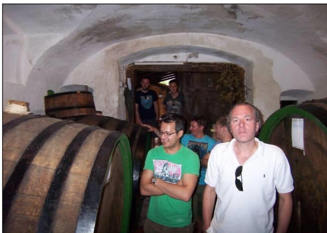
Wine cellar visit

Leaving restaurant, we would drive to Plesivica hills. There is famous Plesivica wine road, and we would visit family Korak or Jagunić, local wine-makers. There we will have wine tasting – 4 different wines.