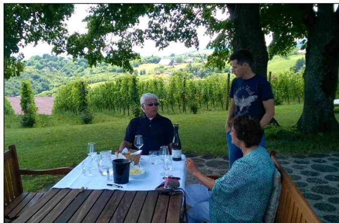
Family Korak – wine-tasting

After wine tasting, we would go back to your hotel (40 minutes' drive). Total tour time: ~ 8 hours