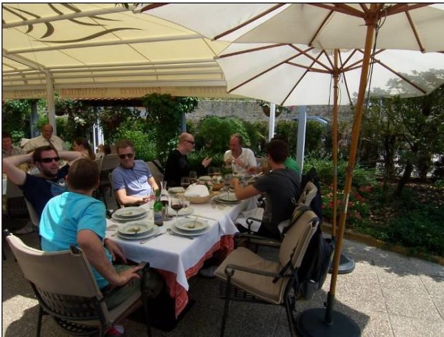
'At the cave' restaurant

After cave visit, we would stay there for lunch. Next to the cave is restaurant 'At the cave' with excellent local food and wine.