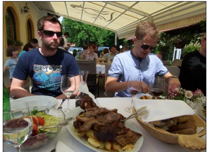
'At the cave' restaurant – local food and wine