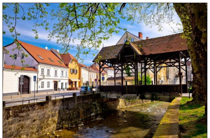
Samobor wooden bridge – charming town center

After Samobor sightseeing we would drive to Grgos cave (10 minutes' drive) and do cave visit (15-20 minutes walking inside the cave). The cave is geomorphologic phenomenon of 'Karst' rocks. It's accidentally discovered by Grgos family, when they excavated raw materials (limestone).