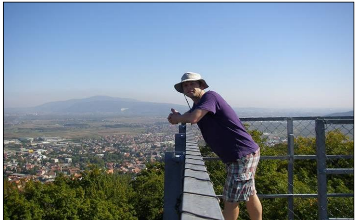
'Steel tower' (view over Samobor and Zagreb)