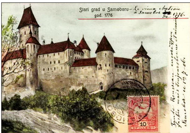
Samobor 'Old town' (fort)